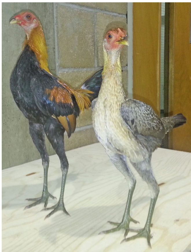
The winning Black Reds

Simon Coia had a good day and won both Brown Red m&f classes with his female going on to be my best modern.